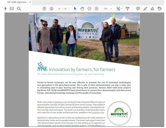
Figure: EIP-AGRI Agrinnovation Magazine (year 2019 / 06).