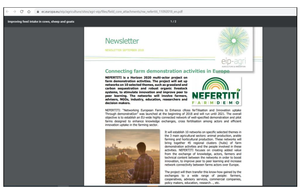
Figure: EIP-AGRI Newsletter, September 2018

Article for NEFERTITI onEIP-AGRI newsletter